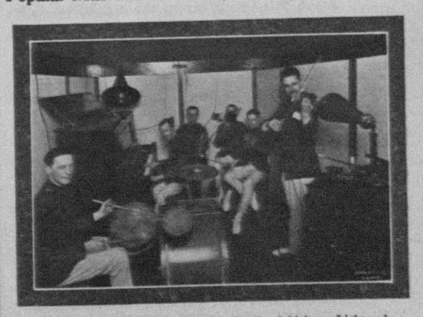
Happy Six Orchestra, playing from Studio of Alabama Light and